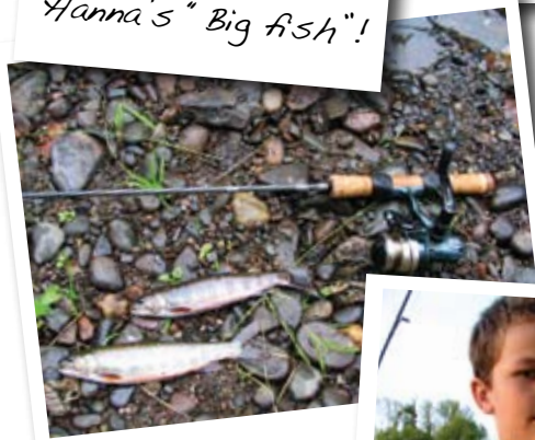
Brook Trout on