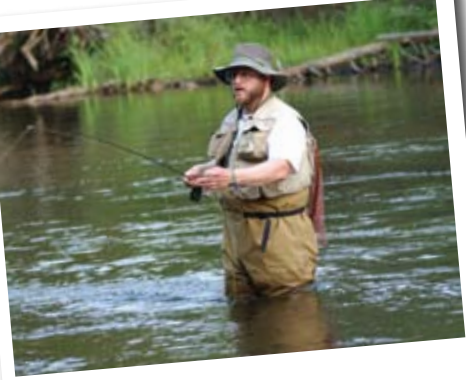
Au Sable River